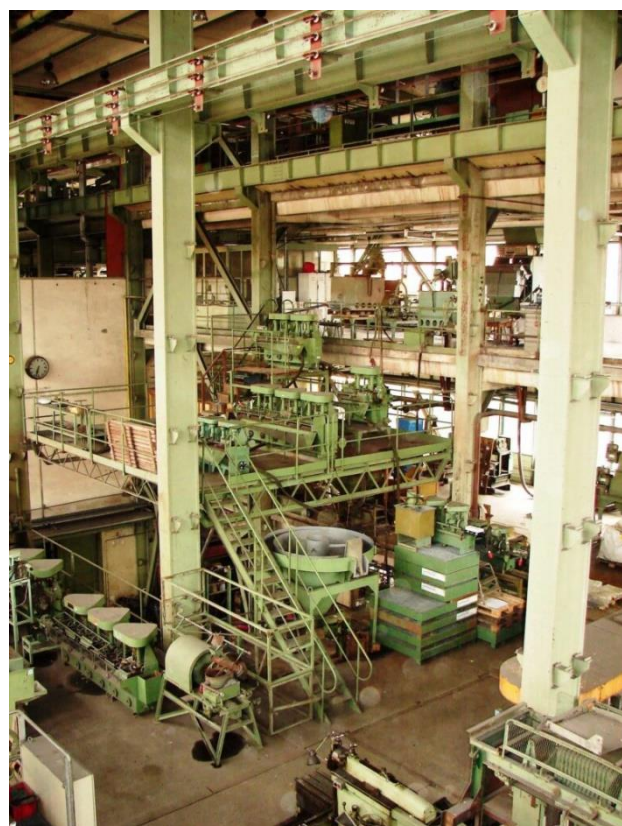
Figure 1 – UVR-FIA bulk grinding (LHS) and flotation (RHS) laboratory in Germany