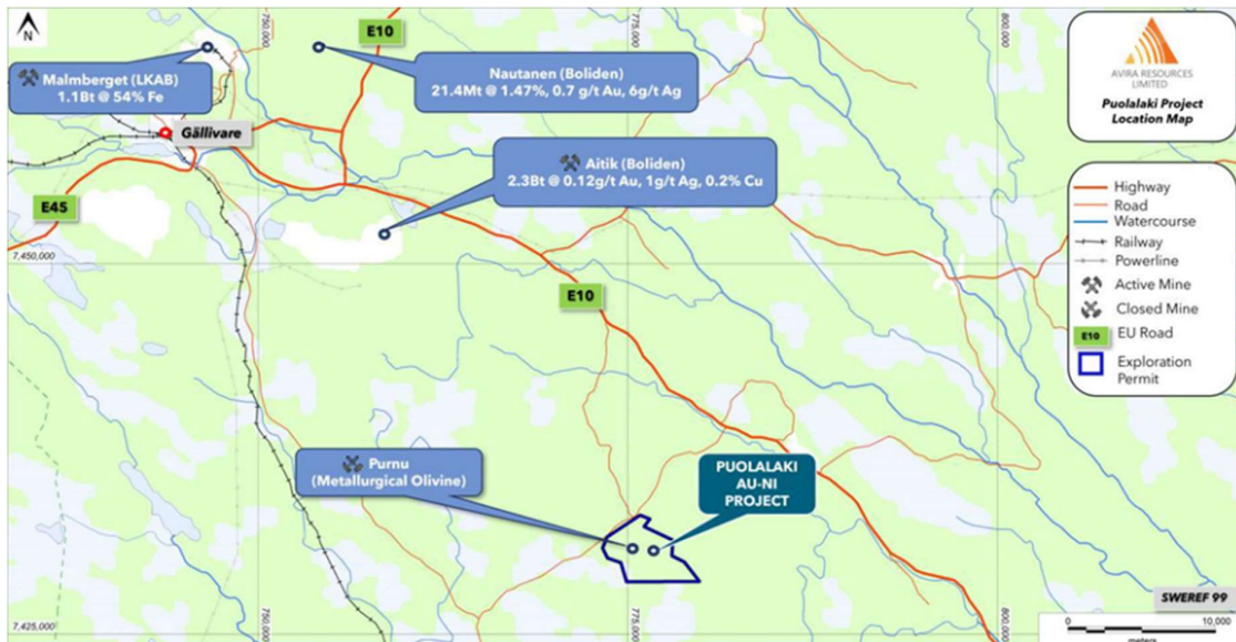
Figure 2: Regional location and mineralisation setting for the Puolalaki Project

In addition to the Ni-Cu mineralisation at Puolalaki, the project also contains significant, high-grade gold ( \pm Cu, W, Mo) mineralisation. The bulk of the historic exploration at Puolalaki was focused on the gold mineralisation that was first discovered by LKAB during the 1980's whilst exploring for metallurgical olivine within the Puolalaki gabbro.