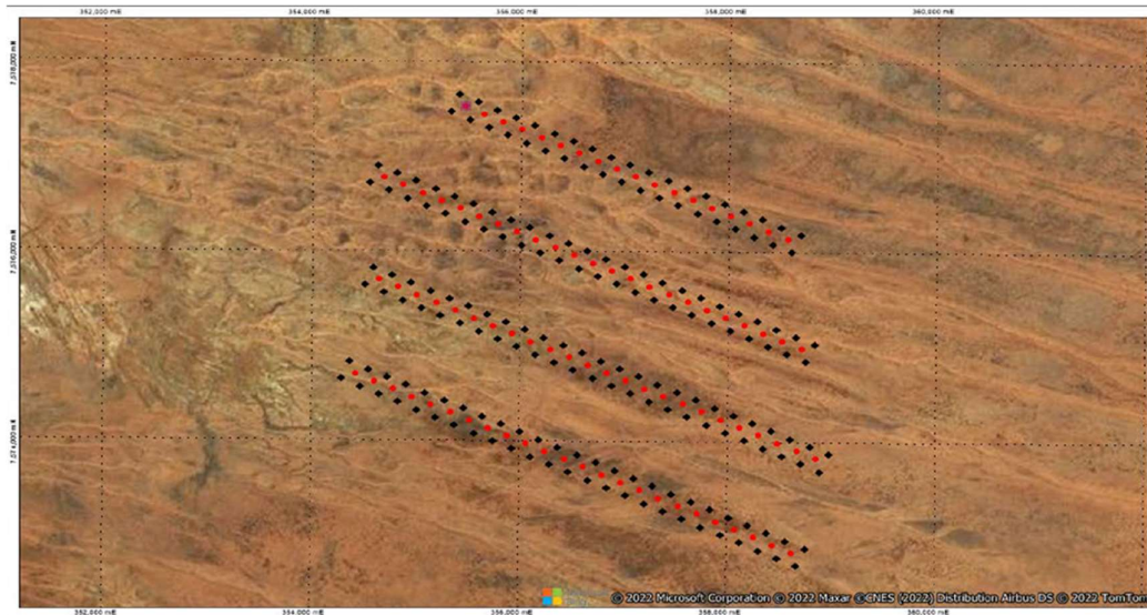
Figure 4: MLTEM Surveying completed at the Mt McPherson project.

All data was acquired with a SMARTem24 instrument combined with an DRTX transmitter and a SMARTcoil sensor working at a low base frequency of 1Hz (250ms time base).