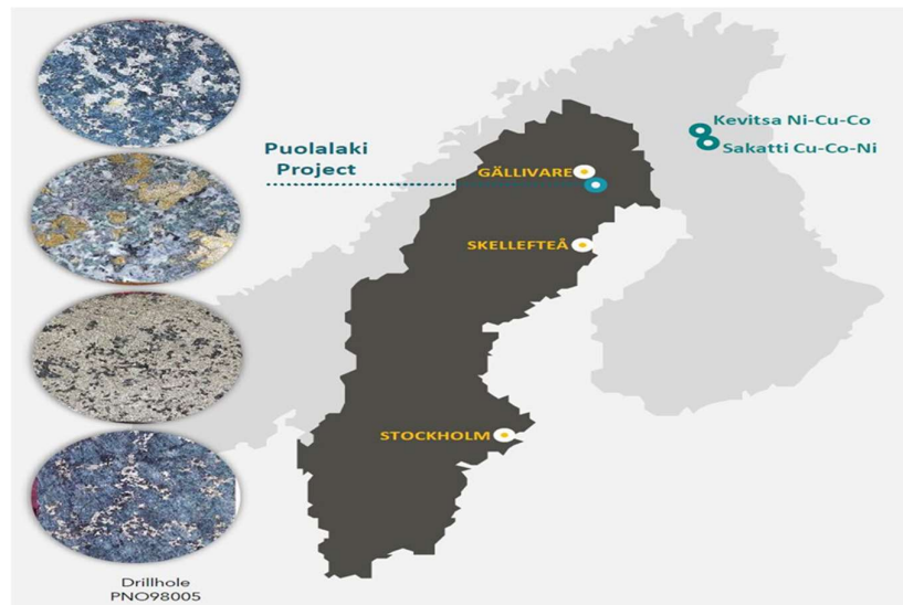
Figure 1: Puolalaki Project location and images showing Ni-Cu mineralisation from project drill-core.

At Puolalaki, (50km SE of Gällivare) Ni-Cu mineralisation is hosted in a syn-orogenic gabbro intrusion that displays evidence of fractional crystallisation and segregation of the mafic melt. Blebby euhedral magmatic sulphide textures are evident in drillholes PNO98004 and PNO98005. In 1998, exploration company North Atlantic Natural Resources (NAN) drilled two holes intercepting magmatic sulphides at Puolalaki effectively confirming the occurrence of Ni-Cu-Co mineralisation within the gabbro intrusion, significant intercepts included: