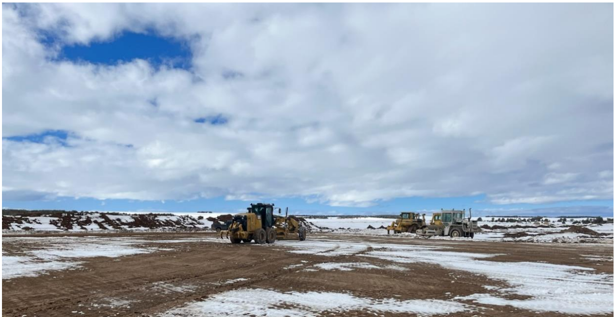
Figure 1: Well site construction on Jesse-2 in SE Utah

Jesse-2 has a binding helium offtake agreement and is located immediately adjacent to pipeline connected to Lisbon Helium plant allowing for near immediate monetisation of a commercial well 2 .