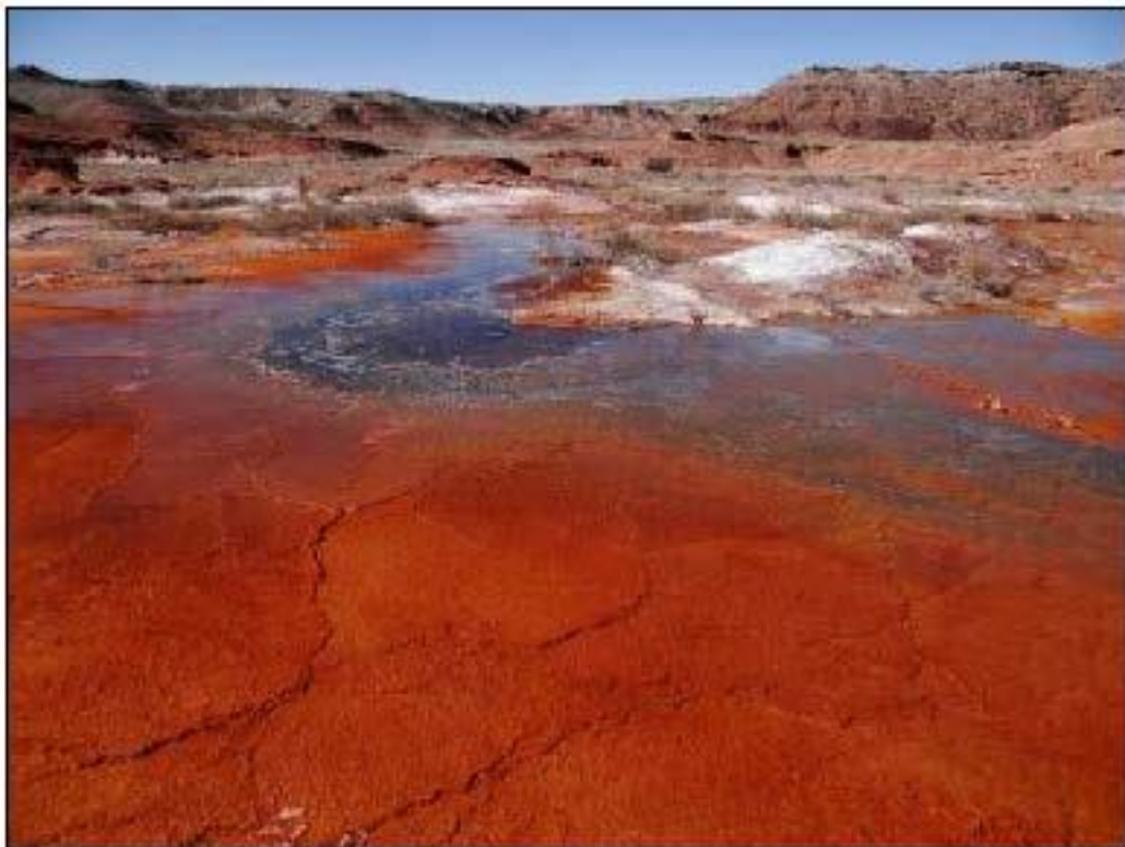
Figure 1: Bubbling geyser near the Mt Fuel-Skyline Geyser 1-25 well.

Anson Resources Limited (ASX: ASN, ASNOC, ASNOD) (Anson or the Company) is pleased to announce the discovery of artesian brine flow from depth to surface at the Green River Lithium Project, in the Paradox Basin in south-eastern Utah, USA, see Figure 1.