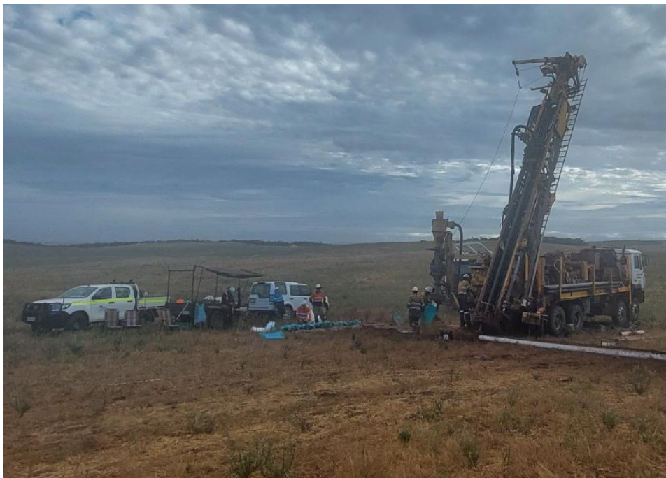
RCP drill rig on location – EL6634

ChemX Materials (ASX:CMX) (ChemX or the Company), a materials technology company focused on providing the critical materials required for electrification and decarbonisation, is pleased to announce the completion on the reverse circulation percussion (RCP) drill program over the northern extent of the Company's Jamieson Tank manganese project on tenement EL6634 in South Australia as illustrated in Figure 1. The program comprised 94 RCP drill holes for a total of 6,164 metres, with samples collected predominantly on 1m intervals and submitted to an external laboratory for preparation and analysis.