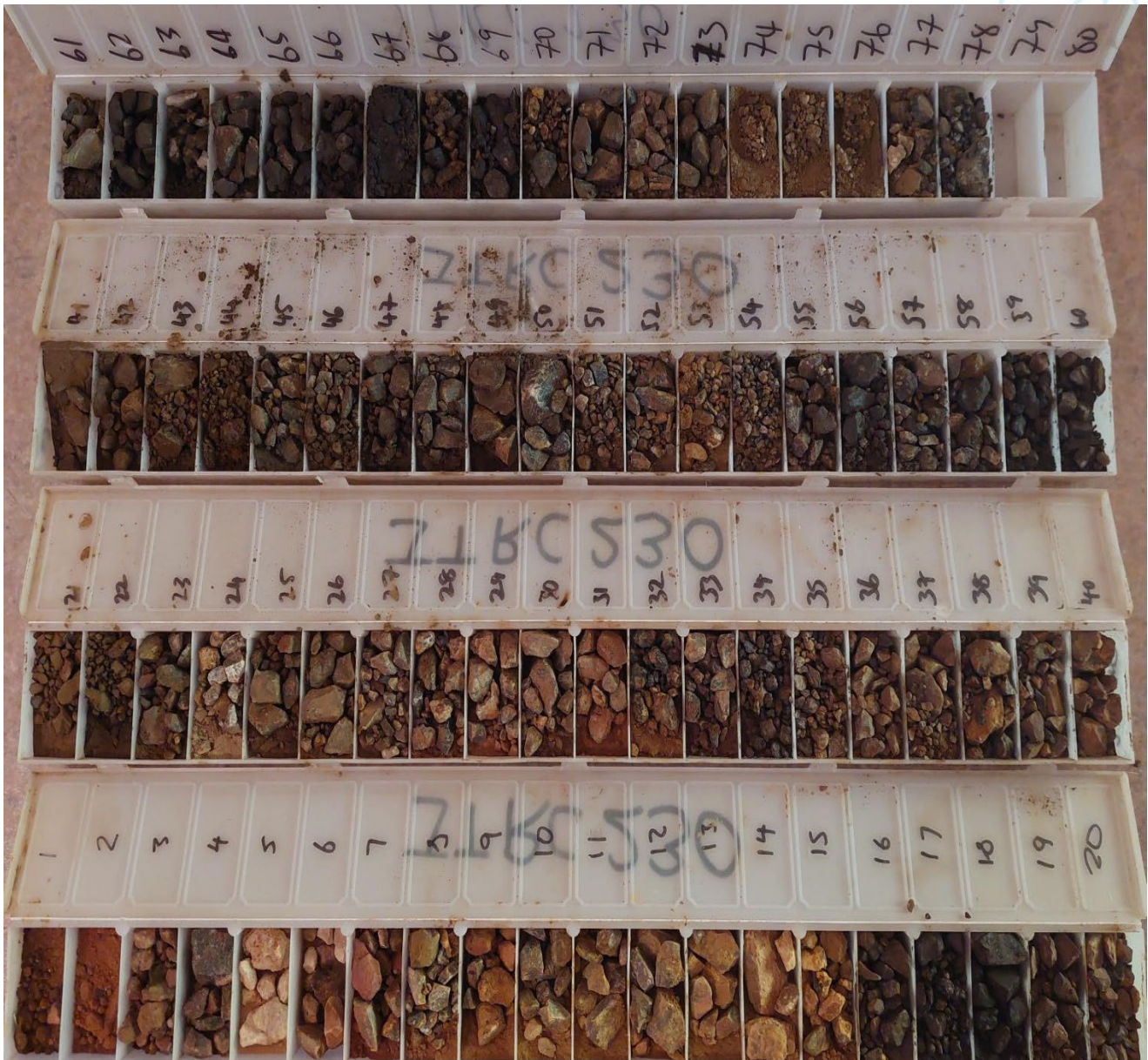
Example of rock chips from the drilling program

The purpose of the drill program was to test the Exploration Target (ASX Announcement 27 July 2022), establish a robust geological control of the manganese mineralisation and produce an initial Mineral Resource Estimate, expected to be finalised before the end of the June quarter 2023.