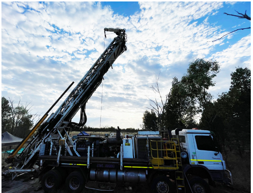
Image: RC Drilling Rig at Tottenham, NSW.

It is proposed to drill up to 10 reverse circulation drill holes in a programme for approximately 2000m at the Laceys Tank Prospect, Jimmy Woodser Mine, Chris Watson Deposit, Orange Plains Mine and Bogan River Mine.