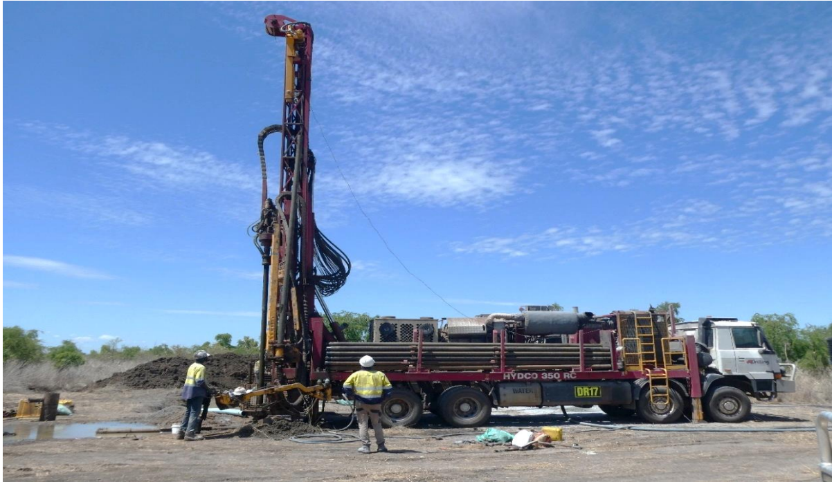
Figure 2: RC Drilling (Phase VI) at Sorby Hills.

Post-period end, the Company received and reported the final assay results from its successful phase VI drilling program (Figure 2). The Phase VI Drilling campaign was designed to increase the value of the later stages of the Sorby Hills Mine Plan. Positive drilling results from the Phase VI program included (Figure 3):