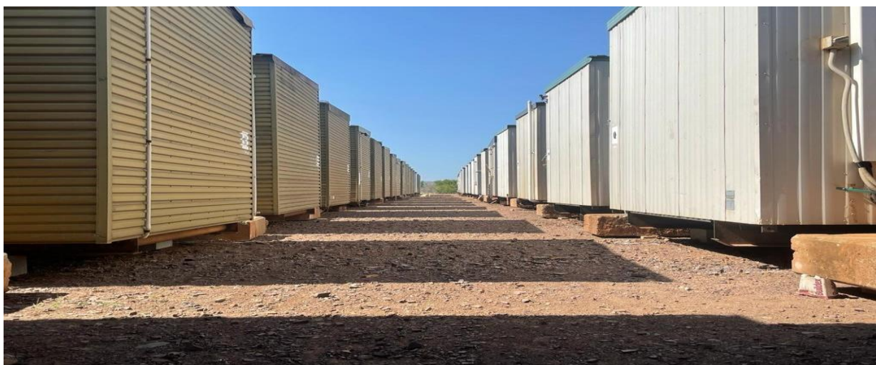
Figure 4 - Accommodation blocks secured by Boab for the Sorby Hills project.

The camp comprises 33 four-room and 23 two-room buildings each with ensuites with A/C, fittings, and furniture included, and 4 laundry buildings (Figure 4). The camp was transported to site during Q4 2022 and will be utilised throughout the project construction and operational phases to house project employees and contractors.