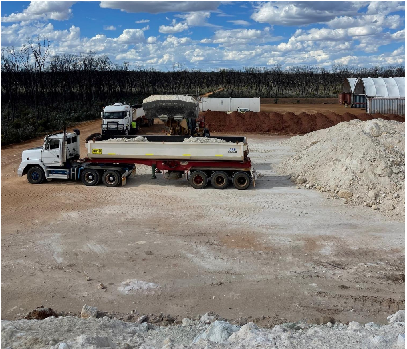
Figure 1: First load of ore being loaded onto 2 trucks at Bulk Sample pit site for transport to processing facility.