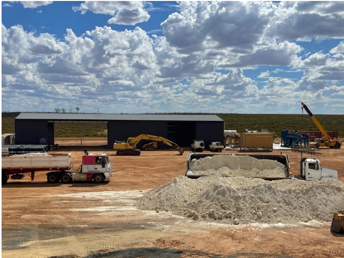
Figure 2, 3, 4 & 5: First ore being offloaded at ROM pad at Kat Gap processing facility.

Classic has commenced the haulage of the ~6,500 tons of ore recovered from the Bulk Sample pit to the plant site as detailed in the following pictures.