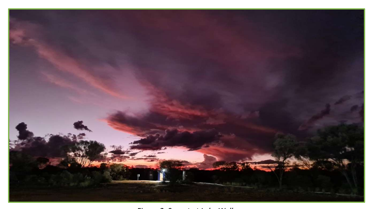
Figure 2: Sunset at Lake Wells

Under the updated production volumes, 65,000 tpa are anticipated to be shipped by bulk from the Port of Geraldton and the remaining production of 140,000 tpa will be shipped from Fremantle in containers. Regardless of bulk versus container, the complete suite of SOP formats will be shipped using both means.