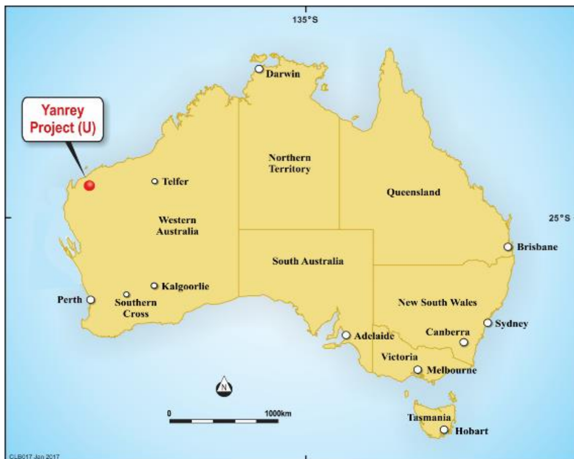
Figure 3: Map Location of Cauldron Projects

The Yanrey Project comprises 15 granted exploration licences (1,548 km 2 ) and 4 applications for exploration licences (626 km 2 ). Yanrey is prospective for large sedimentary-hosted uranium deposits.