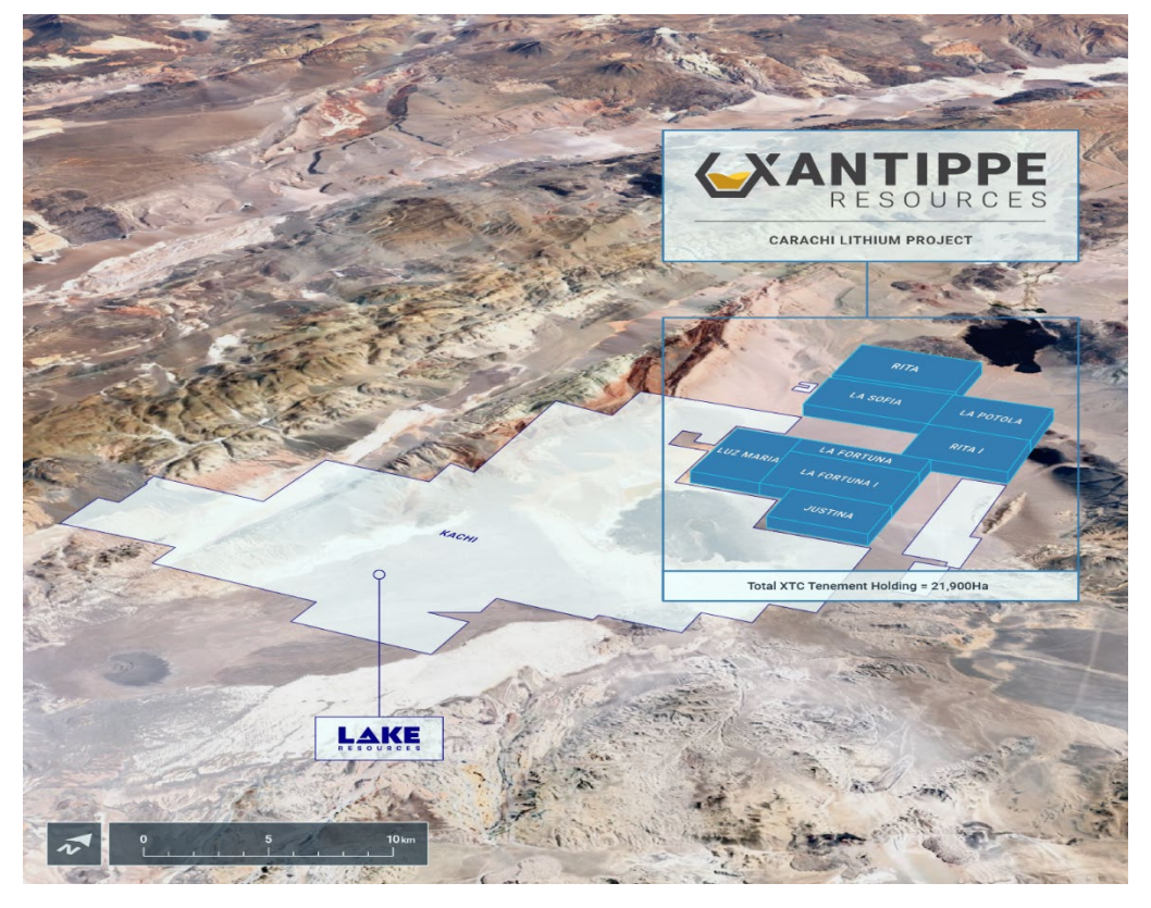
Figure 1: Carachi Pampa Licenses

The next phase of exploration at Carachi will involve exploration drilling. The Company has submitted the environmental impact assessment (EIA) necessary to obtain the permits. The mining authority is in the process of evaluating the EIA for a program consisting of 3,550 metres of exploration core holes to sample and characterise the target aquifer (four holes of 400 metres in south part, one of 500 metres in central portion of the Project and one of up to 950 metres in the north) and one 500-metre pumpable well in the southwest portion of the claim area. The drilling program will commence as soon as the permits are granted.