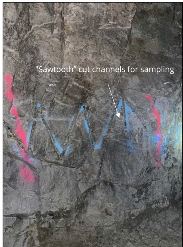
Photos 1 and 2 – Channel sampling of underground walls showing exposed mineralisation. Note sample width is approximately 2.5cm.