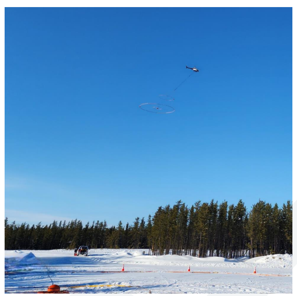
Figure 3: Geotech Limited survey helicopter conducting surveying at Geikie Uranium Project

All preliminary data has now been received and released to the market. Final processed and levelled data is expected in Q2 2023.