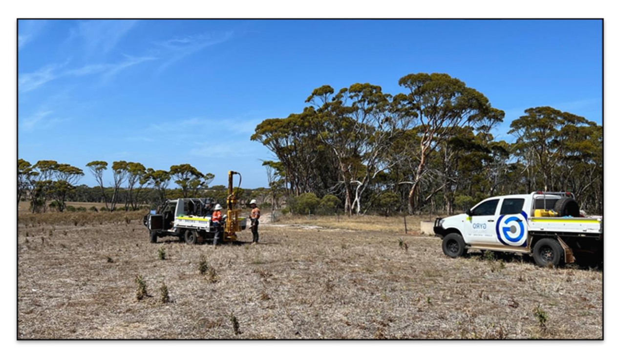
Figure 2: Auger rig at the Mt Cattlin lithium project, Western Australia.