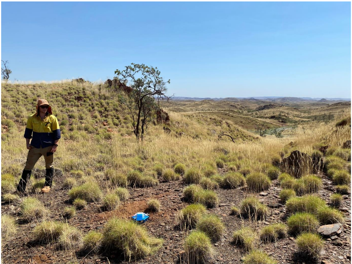
Picture 1. Deployment of Fleet Space ExoSphere ANT system at Tambourah South.

Infinity Mining Limited (ASX: IMI) (the Company or Infinity ) is pleased to announce it has commenced deployment of Fleet Space Technologies Pty Ltd ( Fleet Space ) ExoSphere Passive Seismic Tomography (ANT) technology at its Tambourah South Lithium Project in the Pilbara region of Western Australia, see Picture 1 .