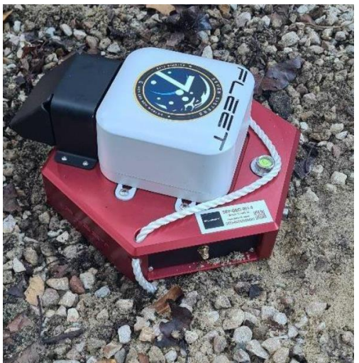
Figure 2. ExoSphere ANT system.