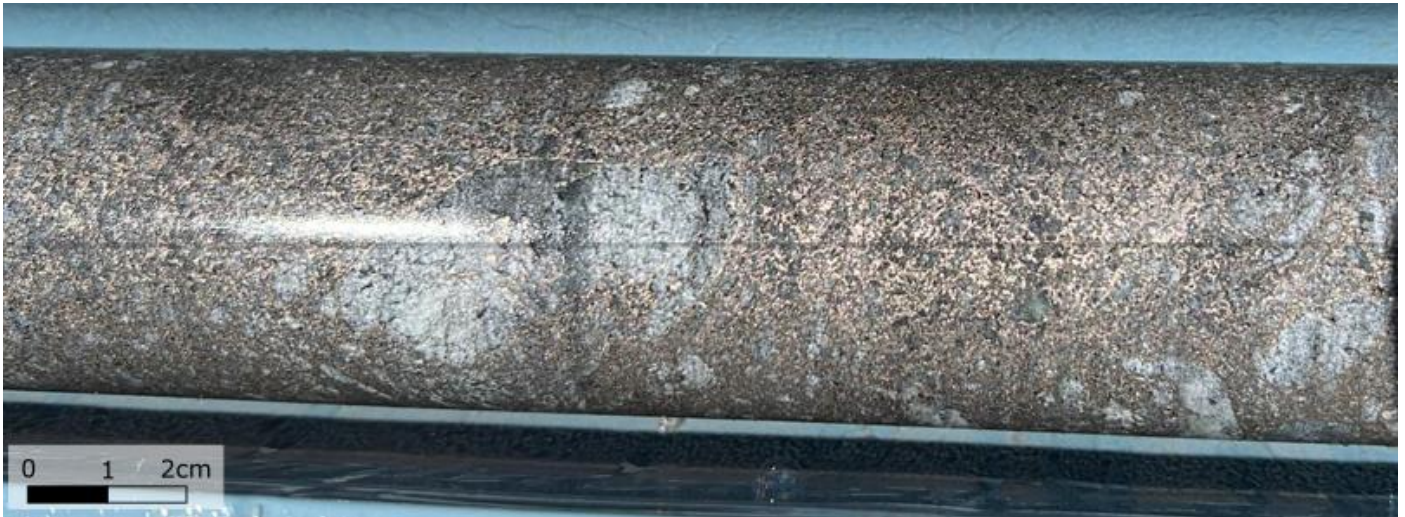
Fig2: Photo of core from BUDD0001 showing the first sulphidic conductor returning 1.13m at 1.83g/t Ag and 0.12% Cu from 46.39m