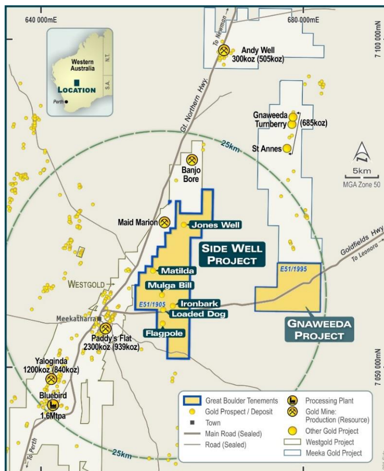
FIGURE 1: SIDE WELL LOCATION PLAN

Great Boulder is a mineral exploration company with a portfolio of highly prospective gold and base metals assets ranging from greenfields through to advanced exploration located in Western Australia. The Company's core focus is the Side Well Gold Project at Meekatharra in the Murchison gold field, where the Company has an Inferred Mineral Resource of 6.192Mt @ 2.6g/t Au for 518,000oz Au. The Company is also progressing early-stage exploration at Wellington Base Metal Project located in an emerging MVT province. With a portfolio of highly prospective assets plus the backing of a strong technical team, the Company is well positioned for future success.