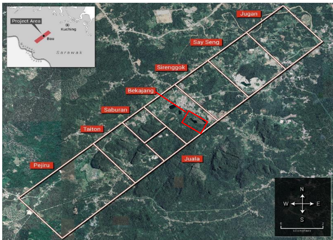
Figure 3: Location of the Bekajang Sector (highlighted within red box) south Bau township in the centre of the Bau Gold Field corridor and adjacent to the most recent commercial mine Tai Parit.

The Bau Gold Field is defined by a gold mineralisation system covering approximately an 8km x 15km corridor, centred on the township of Bau (Figure 3). Within this corridor Besra has identified classified JORC (2012) Resources of Measured 3.4 Mt @ 1.5g/t Au for 166.9koz, Indicated 16.4 Mt @ 1.57g/t Au for 824.8 koz and Inferred 47.9 Mt @ 1.29 g/t Au for 1,989 koz, across a number of discrete deposits. In addition to the JORC-2012 Mineral Resource, the project has a global Exploration Target of between 4.89 and 9.27m ounces of gold @ 1.7–2.5 g/t Au 2 (on a 100% basis).