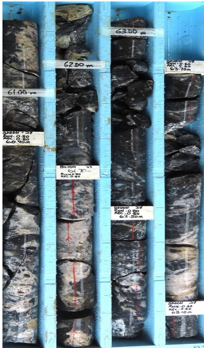
Figure 2: Portion of BKDDH-27 core, between 60.0m-63.7m, illustrating intense alteration in a zone hosting bonanza gold grades: 0.5m @ 209 g/t between 60.5m – 61.0m; 1m @ 64 g/t between 61.0 – 62.0 m; 1 m @ 15.9 g/t between 62.0m – 63.0m & 1m @ 31.8 g/t between 63.0m – 64.0m.