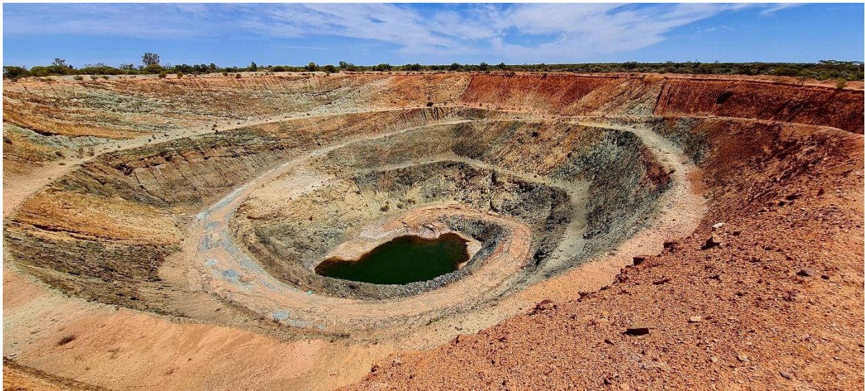
Figure 1: Photograph of Selkirk Pit looking Northwest (March 2023)

The Toll Milling Agreement has been signed by St Barbara Ltd and BML Ventures Pty Ltd (on behalf of the Selkirk Mining JV). The Agreement contains customary terms and conditions associated with contracts of this nature and is reflective of current market conditions for gold ore processing in the WA Goldfields.