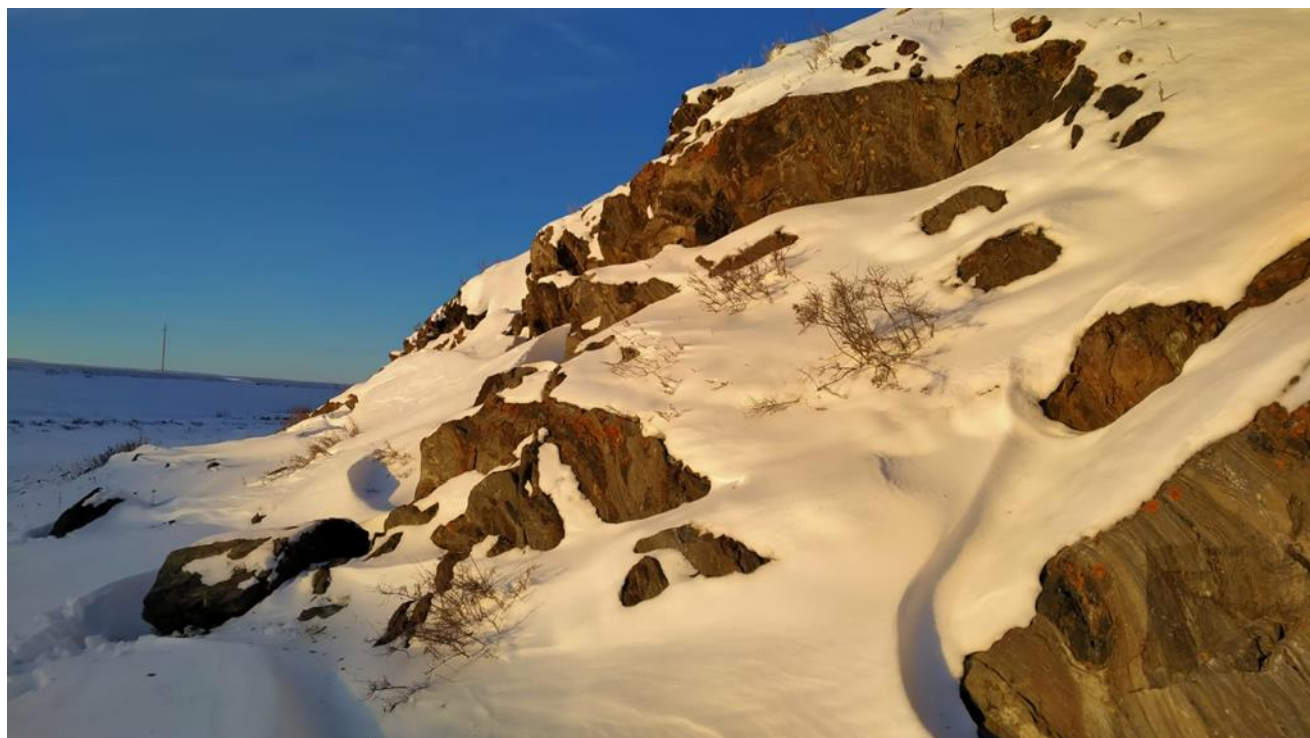
Figure 1 - Outcropping graphitic schist at Kenesar.

"Sarytogan's sustainable competitive advantage is our in-country exploration team's ability to identify, explore and develop mining projects in Kazakhstan. As we move into the studies phase for the giant and premium microcrystalline Sarytogan Graphite Project, our new Kenesar project provides a relatively low-cost opportunity to leverage our future position in the graphite market."