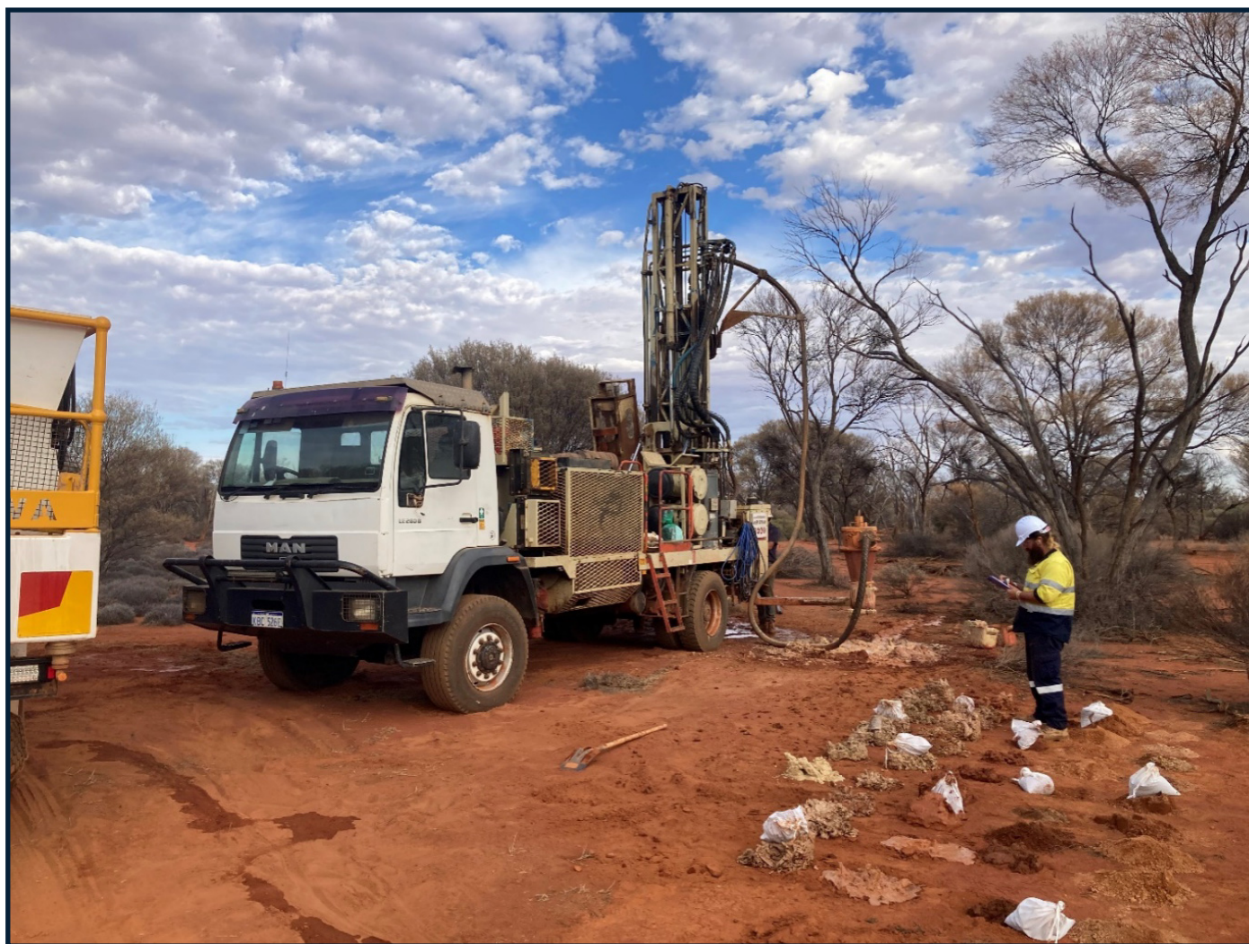
Figure 2: Air-core drill rig at the Four Mile Well project

A total of 242 drill samples have been submitted for laboratory analysis with assay results expected late-April 2023.