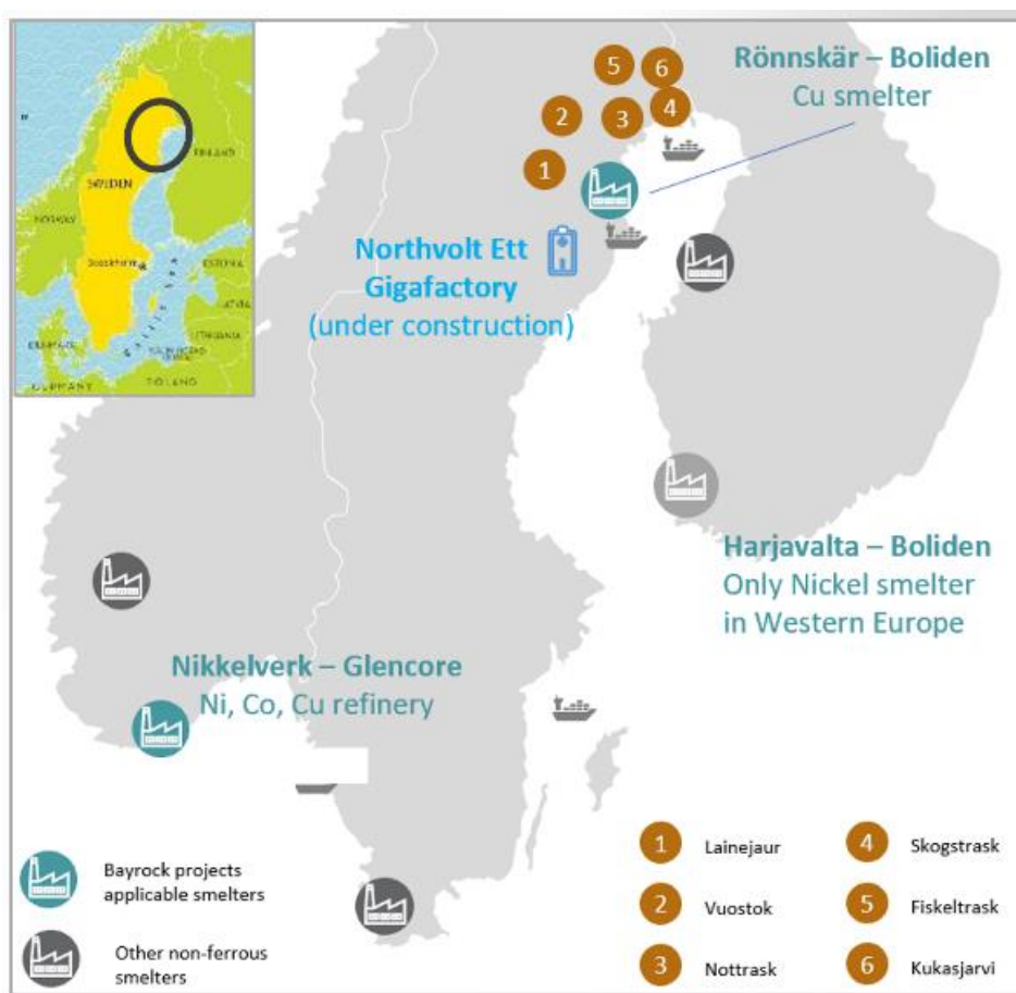
Figure 2: Map of the Bayrock battery mineral projects, including Lainejaur