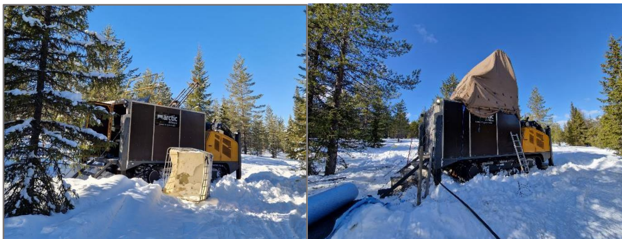
Figure 1: Drill rig setting up at the Lainejaur Ni-Cu-Co project

Potential exists for extensions down dip of the current mineralisation. Further information is available at: www.bayrockresources.com