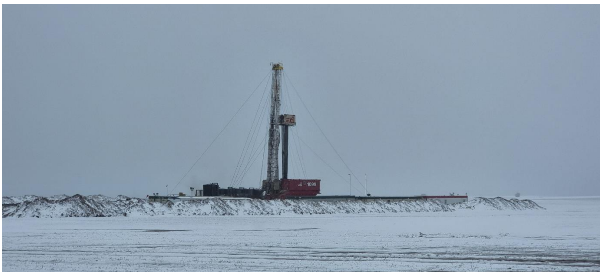
Figure 1: Aztec 1099 drilling rig at the Jesse-2 well site in SE Utah

Jesse-2 is currently drilling ahead in the 8.75 inch intermediate hole section in the Paradox Formation (salt seal) and is anticipated to penetrate the top of the target Leadville formation next week. The rig will then set 7 inch casing in the top of the Leadville formation ahead of drilling and testing the upper and middle Leadville Formation.