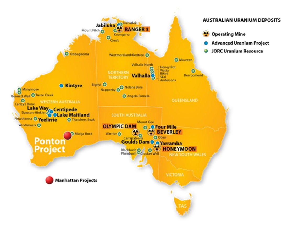
Figure 1: Ponton Project Location

The Company has drill tested and defined relatively shallow (50 to 70 meters deep) palaeochannel sand hosted uranium mineralisation amenable to in-situ metal recovery (ISR).