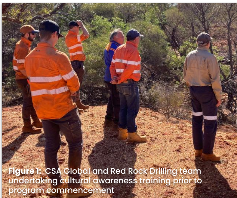
Figure 1: CSA Global and Red Rock Drilling team undertaking cultural awareness training prior to program commencement

Further to the recent announcements regarding the program update (ASX Announcement 14 April 2023), the Company advises that pad preparation work is completed, contractors have been mobilised and drilling has commenced. This program consists of approximately 2,500m of RC drilling and is expected to run for 3 weeks