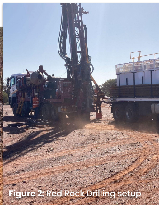
Figure 2: Red Rock Drilling setup