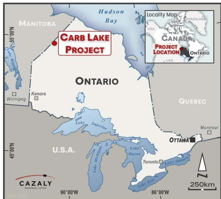
Figure 1. Location of Carb Lake Carbonatite Project in northwest Ontario.

The Carb Lake REE project comprises a large, 2.5 to 3km diameter circular magnetic anomaly known as the Carb Lake Carbonatite Complex prospective for Rare Earth Elements and Niobium. The Project area is located in north-western Ontario, 10km from the Manitoba border. The Project hosts a mid-Proterozoic aged carbonatite which has been emplaced into tonalites within the Northern Superior Superterrane which represents the northernmost exposure of Archaean Rocks in Ontario. The Project is located between two major tectonic terrane boundaries along the North Kenyon Fault, a significant crustal scale fault providing ideal plumbing for mantle derived magma to intrude through to the upper crust. The carbonatite is not exposed at surface with shallow cover from 7 to 12m.