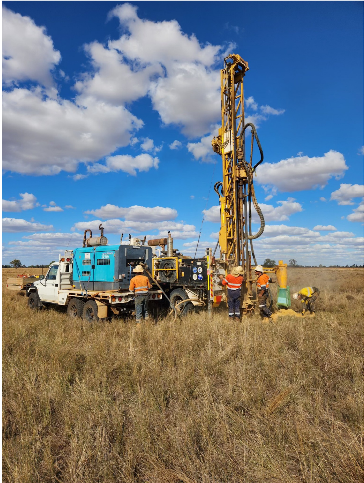
FIGURE 1: DRILLING UNDERWAY AT MALAMUTE