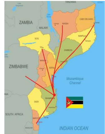
Map 1 - Temane - Central Mozambique Gas Project Area

Post Quarter end, PD has completed works on the WBHO camp and services project and is in the process of handover of the facility to the customer.