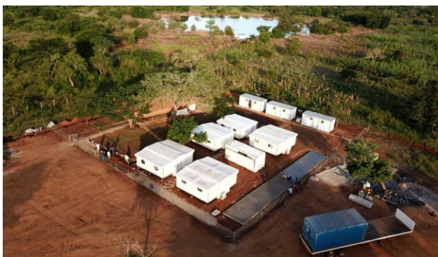
Figure 5 - Shankara Lodge Workers Accommodation

The camp has been utilised to house up to 40 local workers and with the impact of flooding from Cyclone Freddy restricting movement on the Temane PSA project site in February, was a critical staging point for operational administration offices and assembly lay down area.