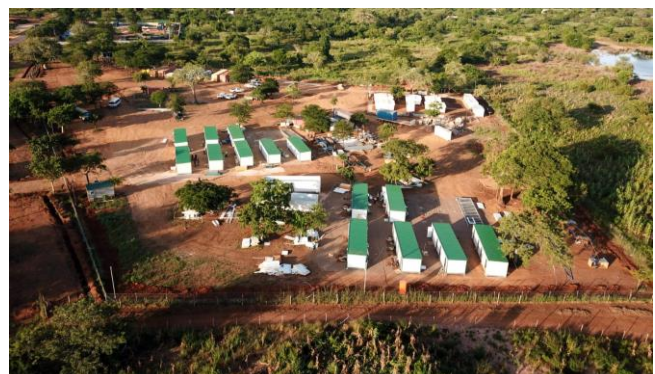
Figure 6 - Shankara Lodge and Assembly Lay Down Area