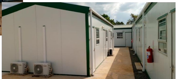
Figure 3 - Accommodation Units