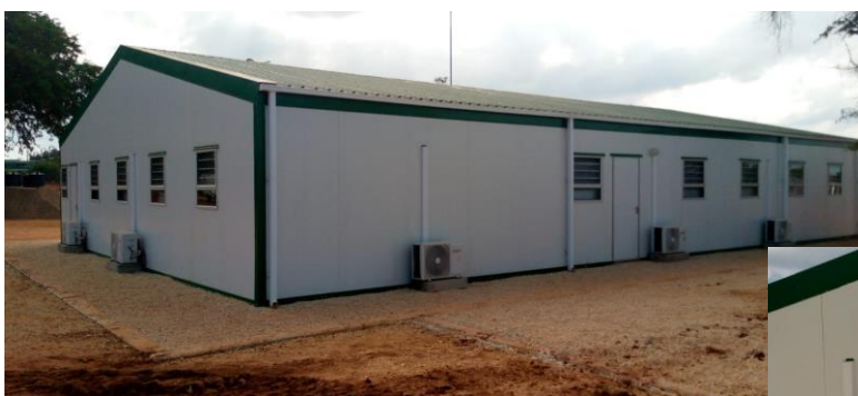
Figure 2 - Mess Hall/Kitchen

Works were completed on time and budget notwithstanding significant challenges as a result of flash flooding from tropical Cyclone Freddy that inundated the central-east coast of Mozambique during February. With handover underway, PD staff and additional local workers have moved to assist additional staff dedicated to the RADX-TSK camp project.