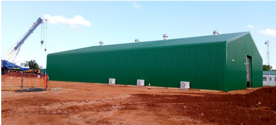
Figure 1 - Equipment Assembly Facility

Works were completed on time and budget notwithstanding significant challenges as a result of flash flooding from tropical Cyclone Freddy that inundated the central-east coast of Mozambique during February. With handover underway, PD staff and additional local workers have moved to assist additional staff dedicated to the RADX-TSK camp project.