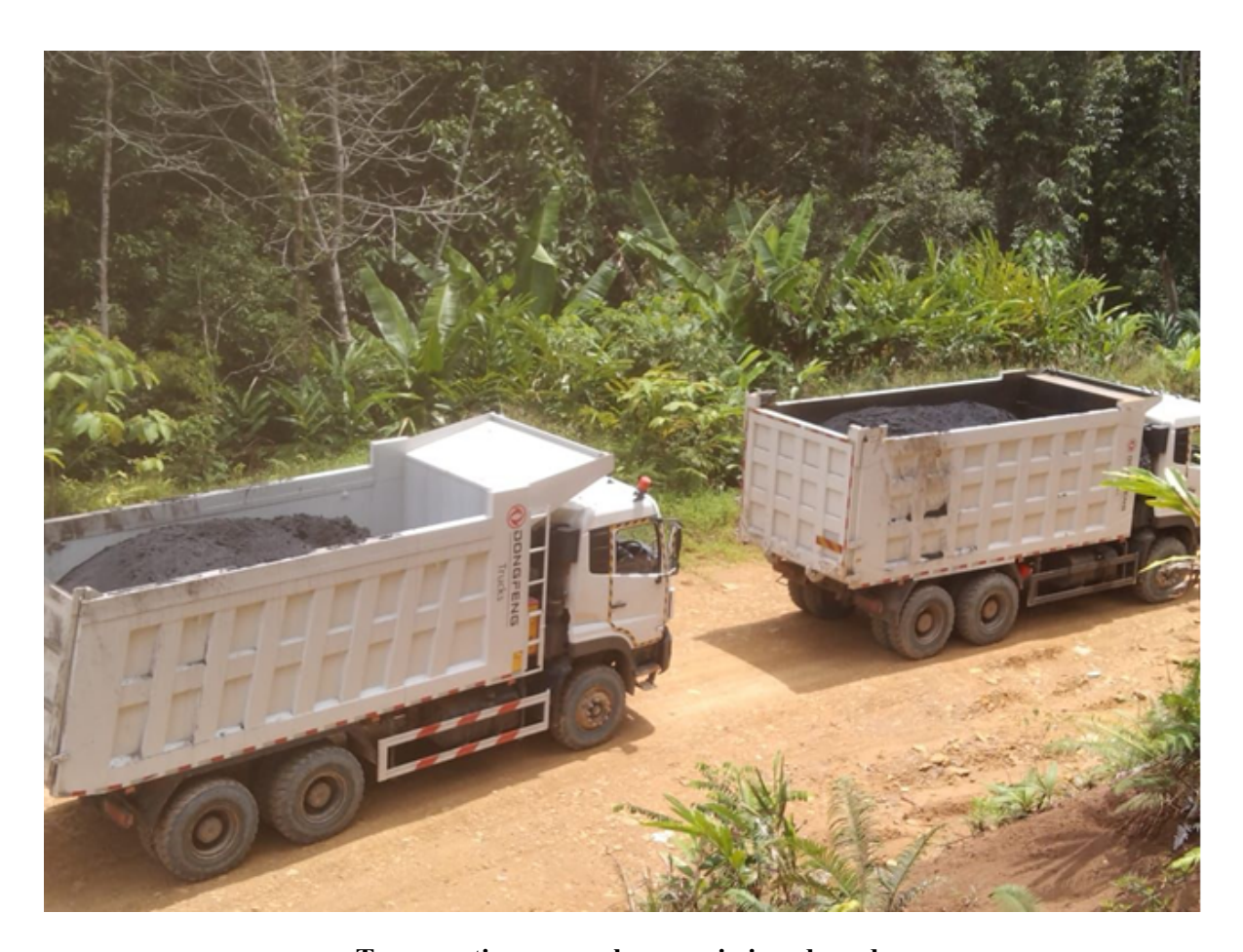
Transporting on newly commissioned road

The commissioning of the road alongside the barging operations means BBM can consistently deliver coal to the Batu Tuhup jetty on a continuous basis. This is an important part of the logistics supply chain for both domestic and international customers as well as an important step in delivering the required volumes of coal to market.