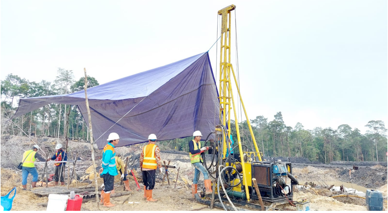
Drilling Works at BBM