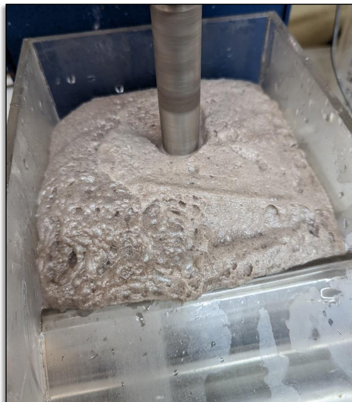
Figure 2. Mt Deans sample undergoing flotation test.

Also of note was that the de-slime also contained lithium, with a grade of 0.63% Li 2 O. Initial assumptions for this are two-fold; RC drilling generated additional fines which reported to the de-slime overflow, and the fluids used by the drillers has affected how the micas have reacted to the reagents in the flotation.