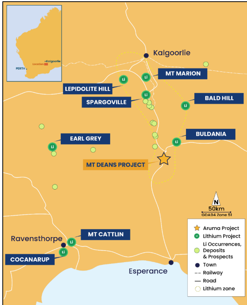
Figure 4: Mt Deans Project location in the Eastern Goldfields lithium corridor