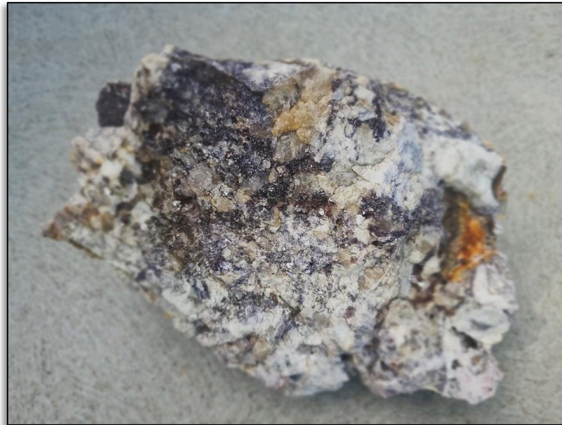
Figure 3. Mt Deans outcrop sample will be put through the floatation testing and then gravity separation. This additional sample will confirm that a detailed sampling program and test work

Based on the positive initial results, Aruma is now in process of conducting a third flotation test, and subsequent gravity separation test, utilising sample that has not been RC drilled. Pegmatite sample from outcrop at Mt Deans has been collected for this purpose, and this next phase of test work will commence immediately.