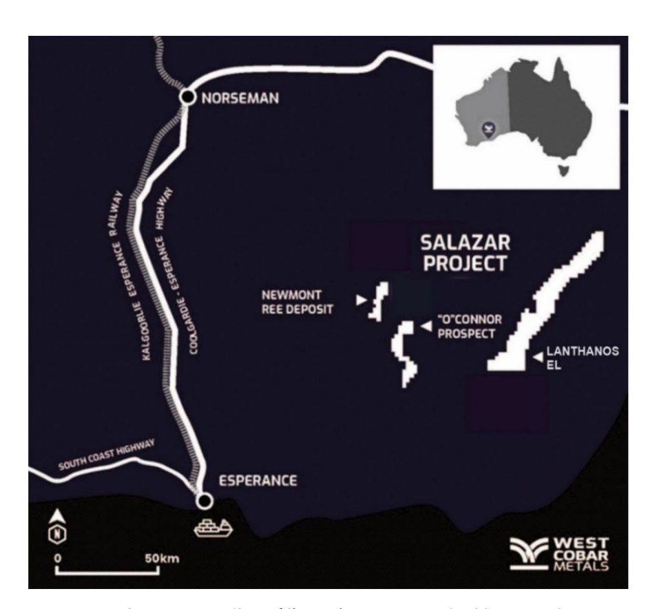
Figure 3: Location of the Salazar REE project tenements