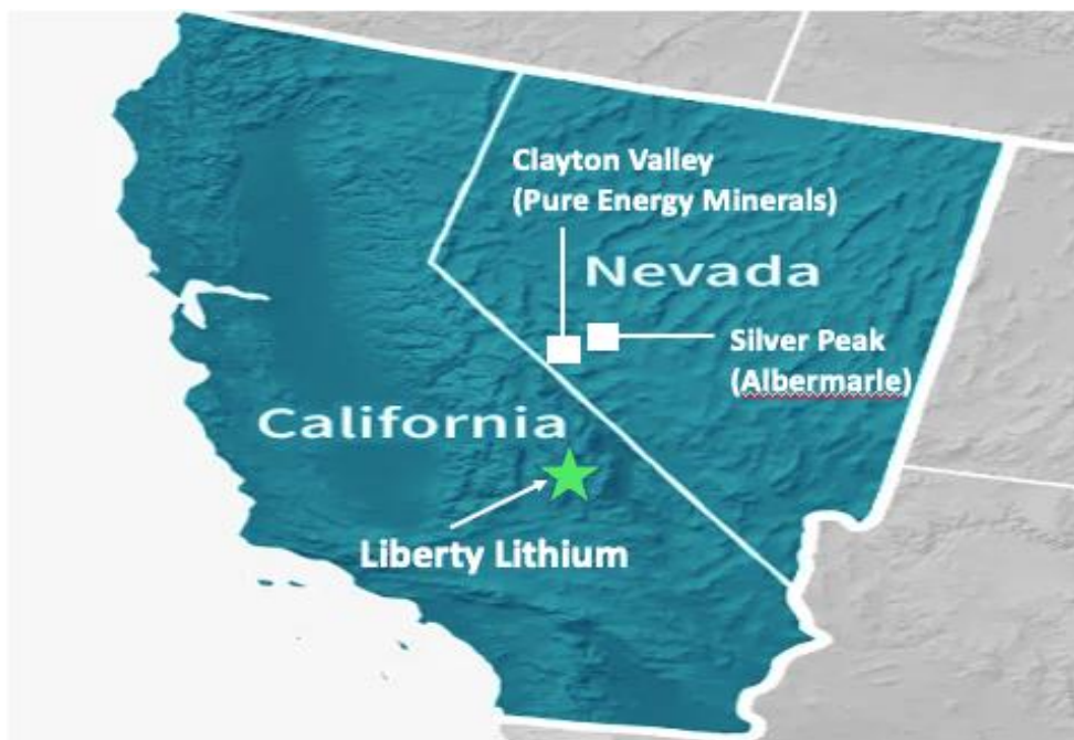
Figure 1: Location map of Liberty Lithium area (Jackrabbit Flat Project)

This LOI provides QXR with a 75-day exclusivity period to conduct technical and legal due diligence and negotiate terms and structuring of an option agreement to acquire 75% of the Project from a private US company. A fee of US$50,000 will be paid for this exclusive LOI period, which would become a break fee if a transaction was not finalised.