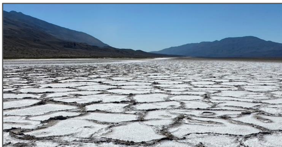
Figure 3: Jackrabbit Flat salt playa at Liberty Lithium