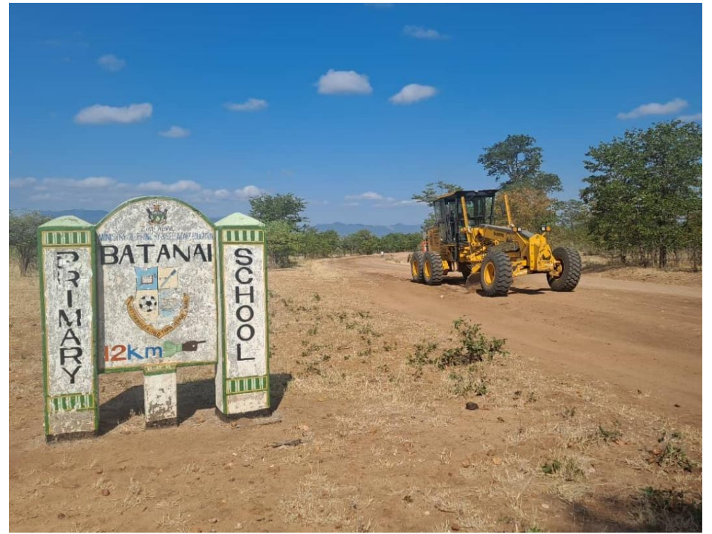
Figure 3 - Upgrade of roads in Muzarabani District