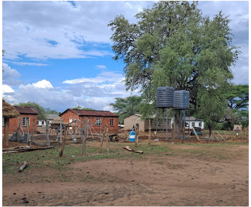
Figure 2 - Installation of permanent water supply to Masoma Clinic and School