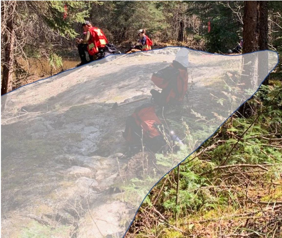
Figure 2 – Field team sampling the Tot Lake Pegmatite (outcrop identified in grey shading)