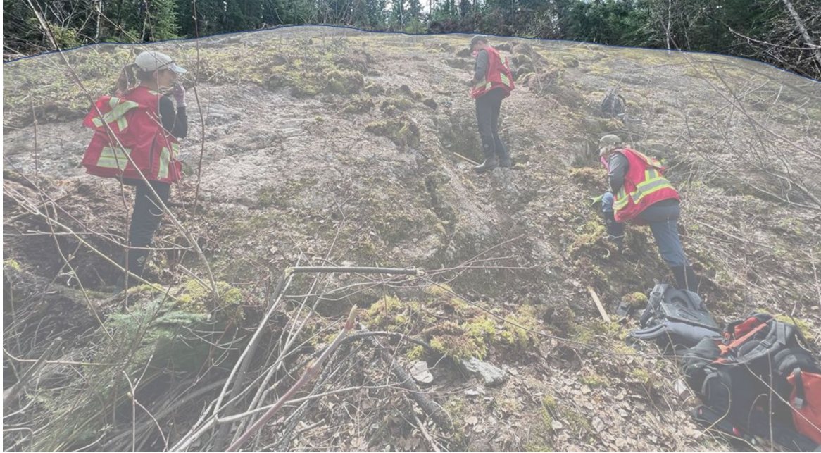
Figure 1 – Field team sampling the Gullwing Lake Pegmatite (outcrop identified in grey shading)