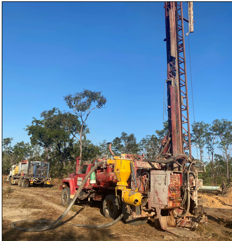
Photograph 1. RC drill rig underway at the first drill-hole location of the maiden drill programme at the Bynoe Lithium Project.