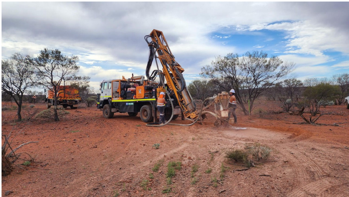
Figure 1 – Air Core Drilling underway at Morck Well Gold Project

Gold and Base Metals explorer Auris Minerals Limited (“Auris” or “the Company”) (ASX: AUR) is pleased to announce that Air Core drilling has commenced at the Company’s Morck Well Gold Project located 130km north of Meekatharra, in the Bryah Basin, Western Australia.