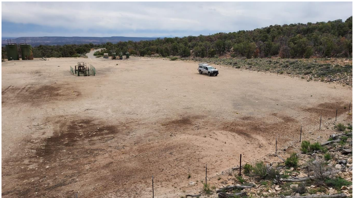
Figure 2 – Available well and pad covered by the Well Access Agreement

We look forward to delivering an exciting period of strong news-flow that will be underpinned by the lithium brine sampling programme across the lease position, utilising existing wells and targeting several reservoir intervals prospective for lithium. The sampling and evaluation phase will facilitate the generation of a maiden Lithium Resource Estimate which in turn will be a value driver for the Company on multiple fronts".