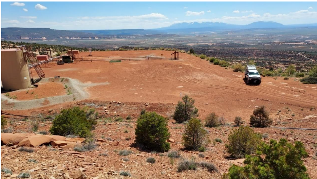
Figure 1 – Suspended well covered by the WAA. Note established well pad and aboveground infrastructure