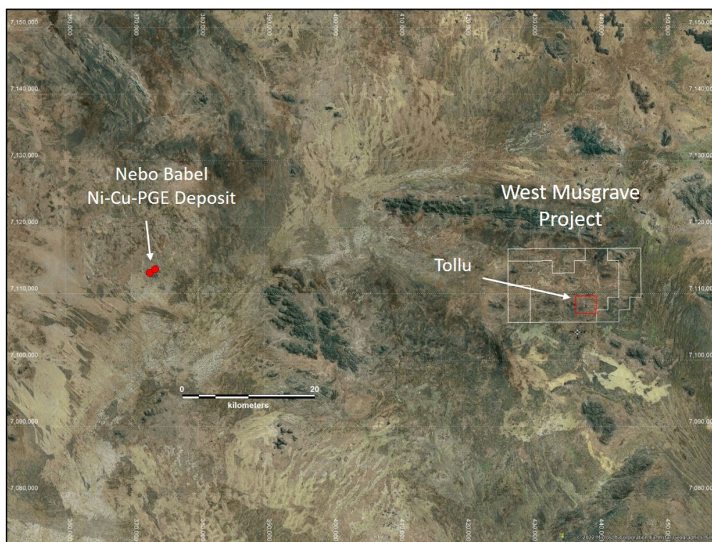
Figure 1 – Location of the West Musgrave Project in relation to the world-class Nebo-Babel Ni-Cu-PGE deposit.

Chatsworth is part of the Tollu Copper deposit on the Company's 100% owned West Musgrave Project (the Project ) in Western Australia, located 40km east of BHP's world-class Nebo-Babel Ni-Cu-Co-PGE deposit (see Figure 1 ).