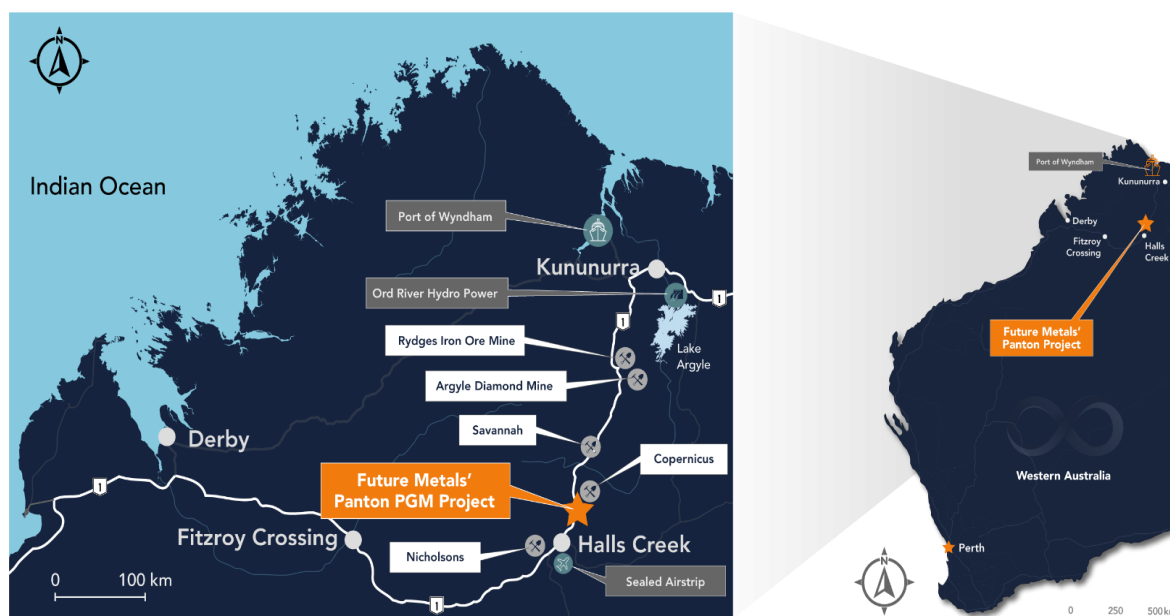
Figure Three | Panton PGM Project's Location

The Company confirms that it is not aware of any new information or data that materially affects the information included in the announcement referenced above.