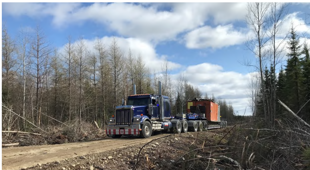
Figure 1: Diamond drilling rig mobilising to site at the Pomme REE-Nd project.

MXV-12-01 – 508.3m @ 0.43% TREO, 413ppm Nb 2 O 5 and 1.48% P 2 O 5 , from 73.7m depth, and MVP-12-02B – 478.1m @ 0.12% TREO, 340 ppm Nb 2 O 5 and 2.14% P 2 O 5 , from 25.9m to EOH.