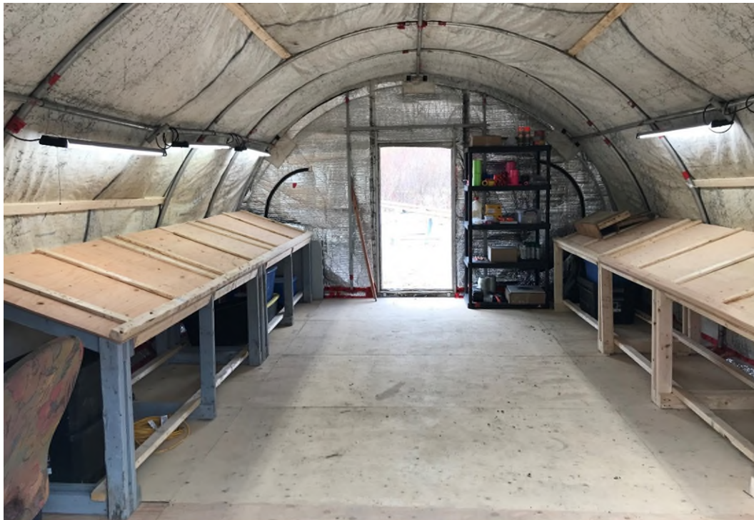
Figure 3: Core logging shed ready to receive drill core.