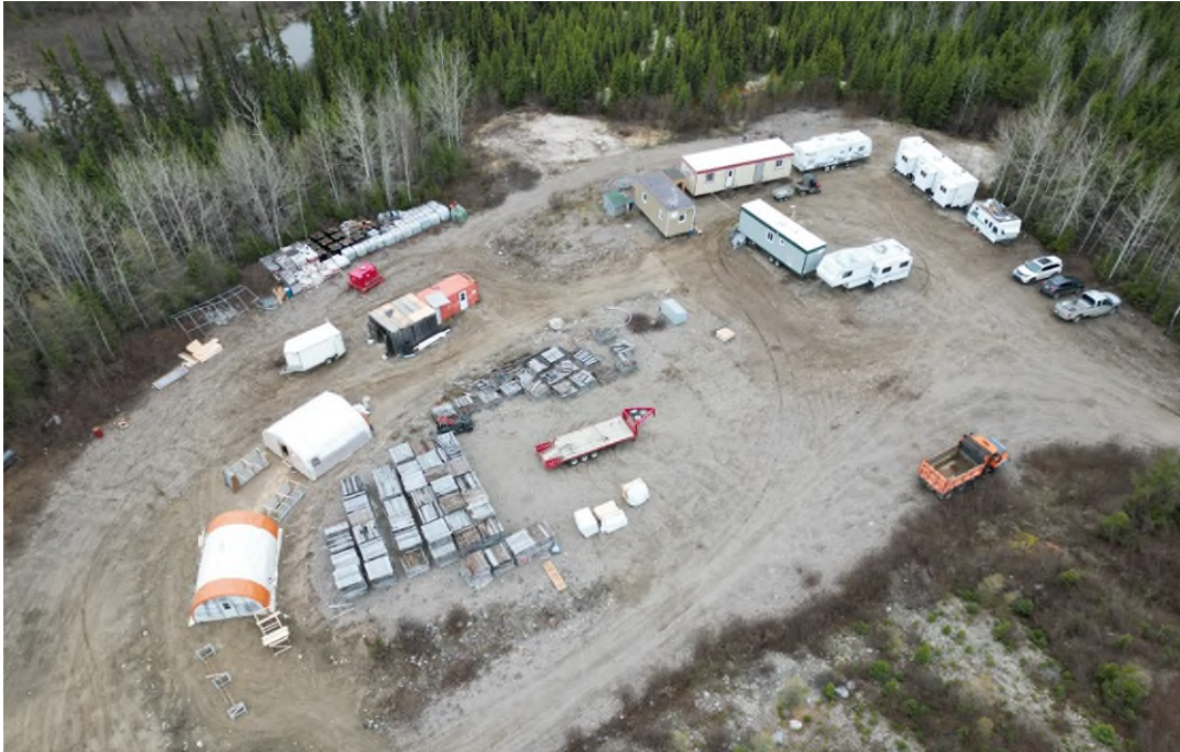
Figure 2: Drone photograph of the Pomme exploration camp.

We are excited to get underway with the exploration of the Pomme carbonatite complex for a new rare earth element and niobium deposit and we look forward to updating shareholders as the work progresses.”