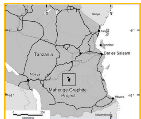
Location of Black Rock's Mahenge Graphite Project in Tanzania

For further information on Black Rock Mining Ltd, please visit www.blackrockmining.com.au