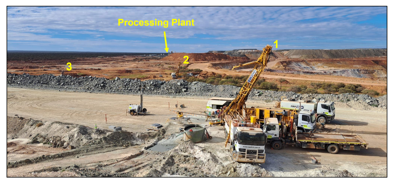
Figure 1 : Three drill rigs (two diamond rigs – #1 & #2 and 1 RC rig – #3) drilling out the high-grade Never Never Gold Deposit with the 2.5Mtpa Dalgaranga Process Plant in the background.

Gascoyne Resources Limited (" Gascoyne " or " Company ") (ASX: GCY) is pleased to report metallurgical testwork results for the high-grade Never Never Gold Deposit at its 100%-owned Dalgaranga Gold Project in Western Australia.