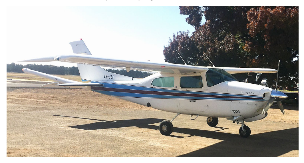
Image 3: Thomson Airborne Aircraft Conducting SensOre's Research Work

The survey completed on 28 May and is expected to be followed up with a ground campaign as part of further geological and geochemical studies as SensOre looks to harness its advanced AI – Machine Learning technology approach to assist accelerated minerals exploration programs.