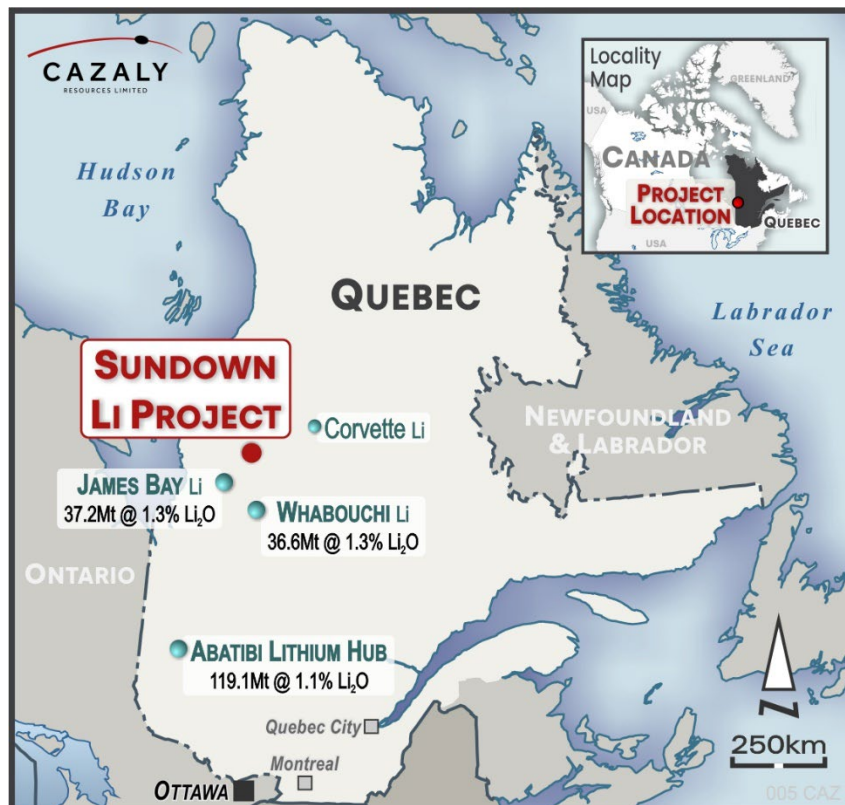
Figure 1. The Sundown Lithium Project, James Bay District.

Cazaly Resources Limited (ASX: CAZ, “Cazaly” or the “Company”) is pleased to announce it has entered into an exclusive binding agreement to acquire up to 100% of the Sundown Lithium project (the Project). The Project is located in the world-class James Bay Lithium Province, host to several advanced lithium projects and new lithium discoveries in Canada and comprises 510 mining claims covering pegmatite outcrops spanning over 260sqkm.