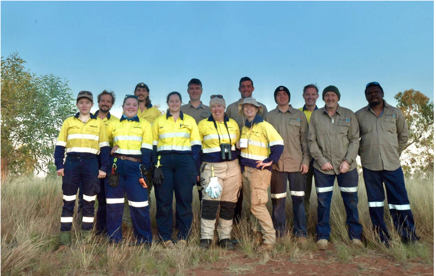
Figure 1: The Rapallo and RareX field teams supporting the post wet-season flora and fauna survey

The results of the survey will be used to inform regulatory approvals and drive the development of an environmental management plan for the project. The management plan will ensure that any future mining activities are undertaken in a way that minimize the impact on the environment.