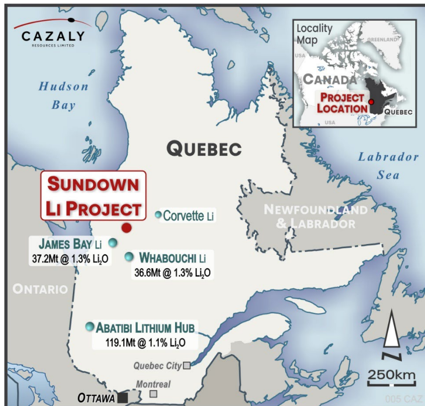
Figure 1. The Sundown Lithium Project, James Bay District.

Cazaly Resources Limited (ASX: CAZ, "Cazaly" or the "Company") is pleased to announce it has entered into an exclusive binding agreement to acquire up to 100% of the Sundown Lithium project (the Project). The Project is located in the world-class James Bay Lithium Province, host to several advanced lithium projects and new lithium discoveries in Canada and comprises 510 mining claims covering pegmatite outcrops spanning over 260sqkm.