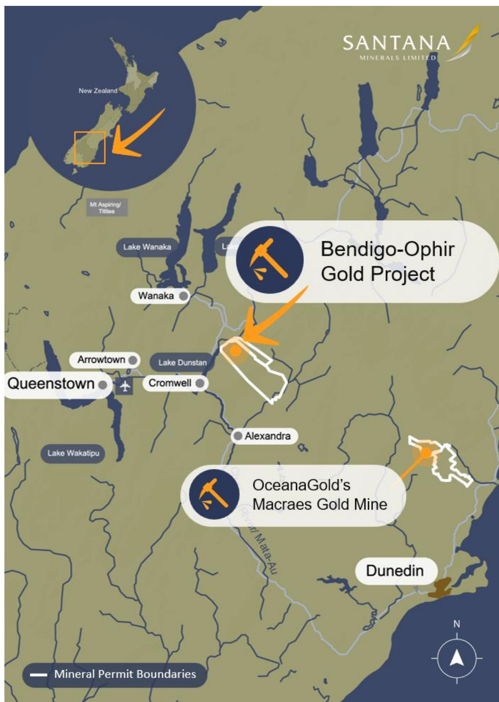
Figure 1 - Bendigo-Ophir Project in the Otago Goldfield, ~90km NW of Macraes

The Bendigo-Ophir Project is located on the South Island of New Zealand within the Central Otago Goldfields. The 292km 2 project area comprises Minerals Exploration Permit (MEP) 60311 (252km 2 ) issued to 100% owned subsidiary Matakanui Gold Ltd (MGL) and Minerals Prospecting Permit Application (MPPA) 60882 (40km 2 ) made by MGL.