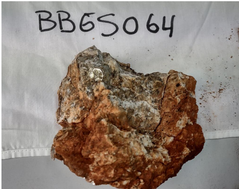
Figure 1: Samples of pegmatite BBGS050 (297044 mE, 6568534 mN, MGA94 Zone 51) and BBGS064 (298605 mE, 6581179 mN, MGA94 Zone 51) each with feldspar, mica, quartz and garnets.