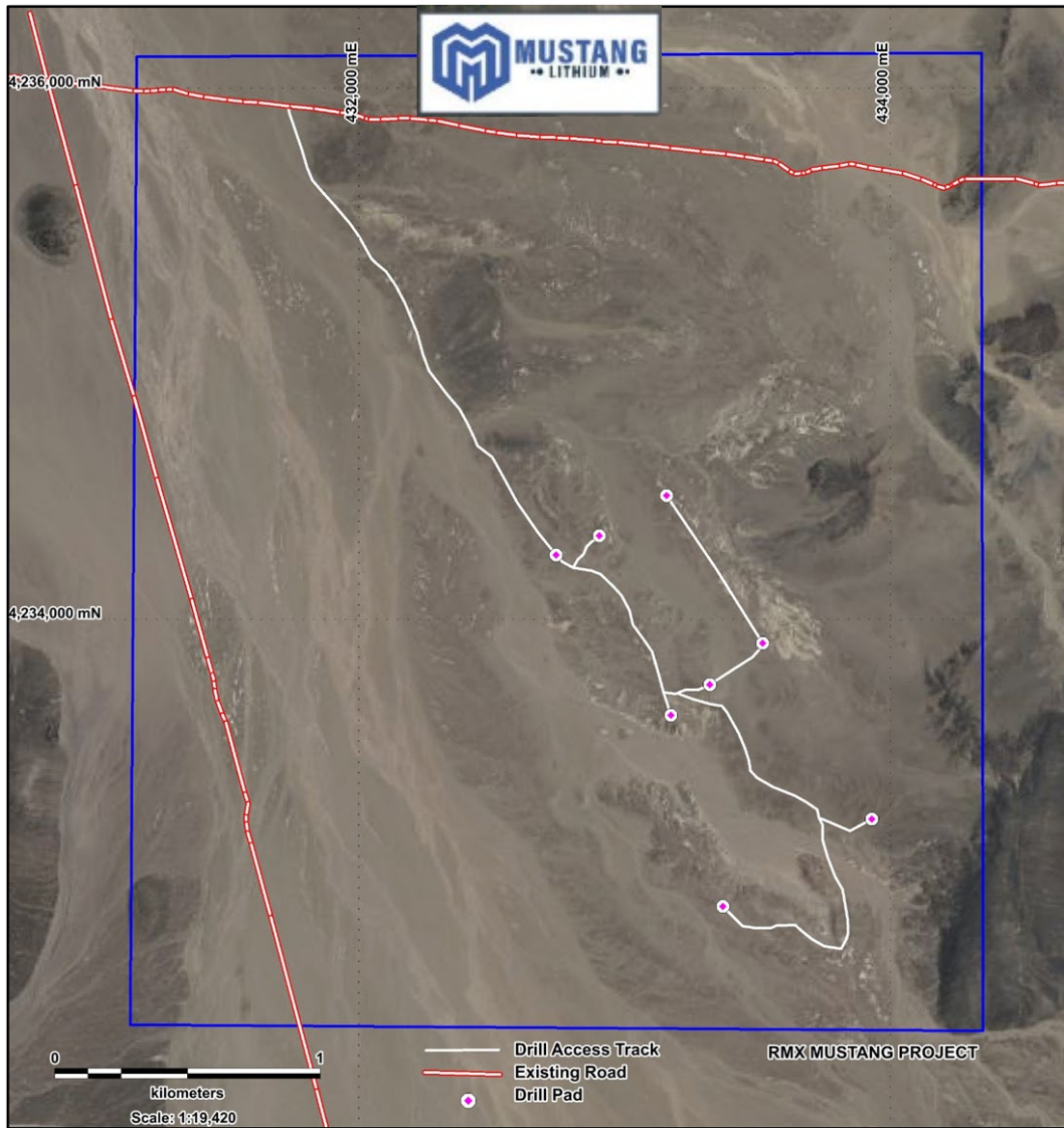
Figure 2. RMX's Mustang Project with Phase 1 Proposed Drill Holes