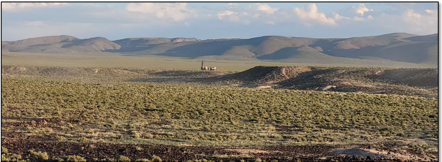
Figure 1. RC drill rig on site and Phase 1 drilling has commenced

Red Mountain Mining Limited (“ RMX ” or the “ Company ”) is pleased to announce that the Reverse Circulation (RC) drill rig is on site and phase 1 drilling has commenced at the Mustang Lithium Project in Nevada, USA.