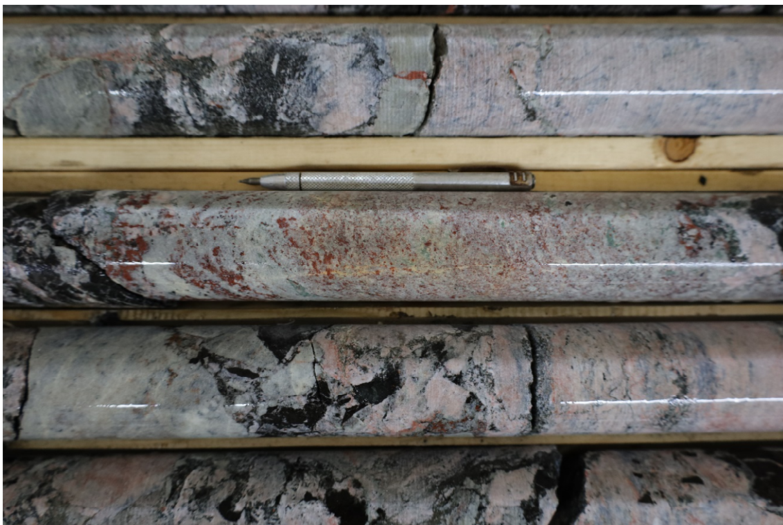
Figure 3: Diamond drill core (NQ, approximately 4.8 cm diameter) containing REE mineralisation (red coloured disseminations) within ferrocyanatite/calciocyanatite host rock. Hole POM-23-01, Box 15, 91.1 – 95.5 metres downhole depth.

The mineralisation, which is tentatively identified as the fluoro-carbonate minerals cebaite ( Ba_3(Nd,Ce)_2(CO_3)_5F_2 ) and/or bastnaesite ( (La,Ce,Y)CO_3F ), has a very distinct red colour and is easily distinguished in the drill core (see Figures 3 to 5). Monazite ( (La,Ce,Nd)PO_4 ), a brownish phosphate REE mineral, also occurs frequently in the first hole and apatite enriched in REE was locally logged within specific carbonatite layers. The mineralisation occurs as medium to coarse-grained disseminations and blebs allowing the geologists to make a subjective estimate of the REE grade (Appendix II).