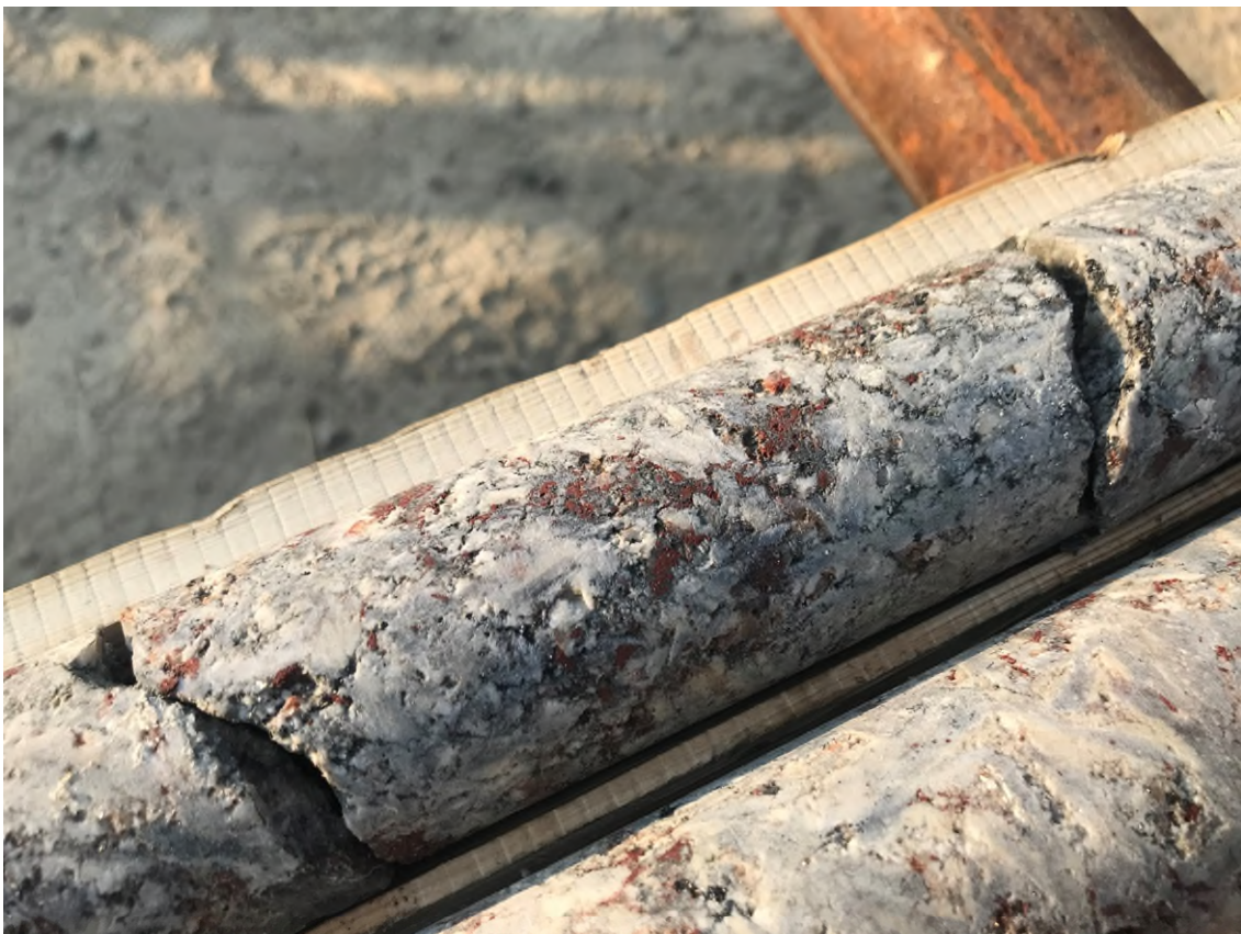
Figure 5: Diamond drill core (NQ, approximately 4.8 cm diameter) containing REE mineralisation (red coloured disseminations) within ferrocarbonatite host rock. Hole POM-23-01, Box 104, 475.6 – 479.9 metres downhole depth.