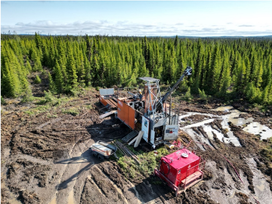
Figure 1: Diamond drill rig operational on hole POM-23-001 at the Pomme project, May 2023.